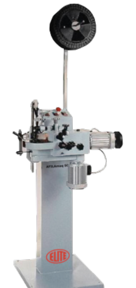
Image 1: frontal control panel, with only the necessary buttons for very easy handling.

Image 2: setting machine installed on the grinding machine, as optional.