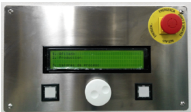
LCD screen that allows a very easy system for programming the grinding steps thanks to its guided steps. Production program for equal series available as a standard.