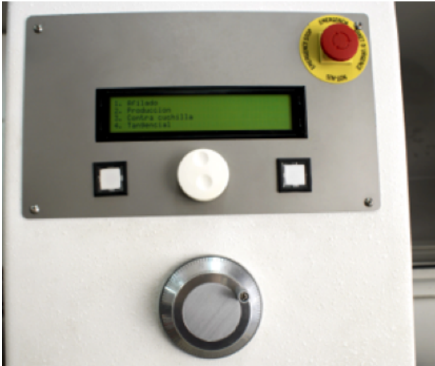
LCD screen that allows a very easy to use programming system with control guided steps.