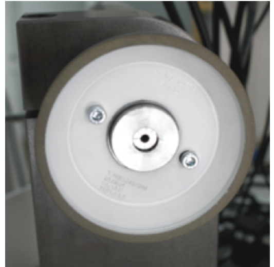
Cup grinding wheel Optional: Cup + tangential grinding wheel