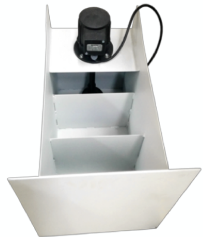
Cooling equipment with 2 bar and 20 l/min., with 80 lts. tank, pump and faucet.